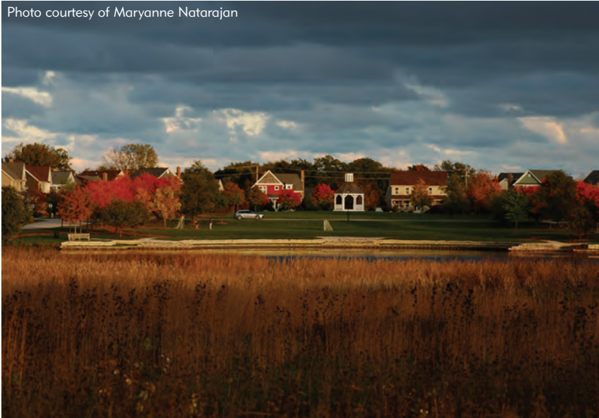
Prairie Crossing in Illinois

People will want live near trains when the economy comes back. People will be more frugal, will have fewer cars, and they will use trains.