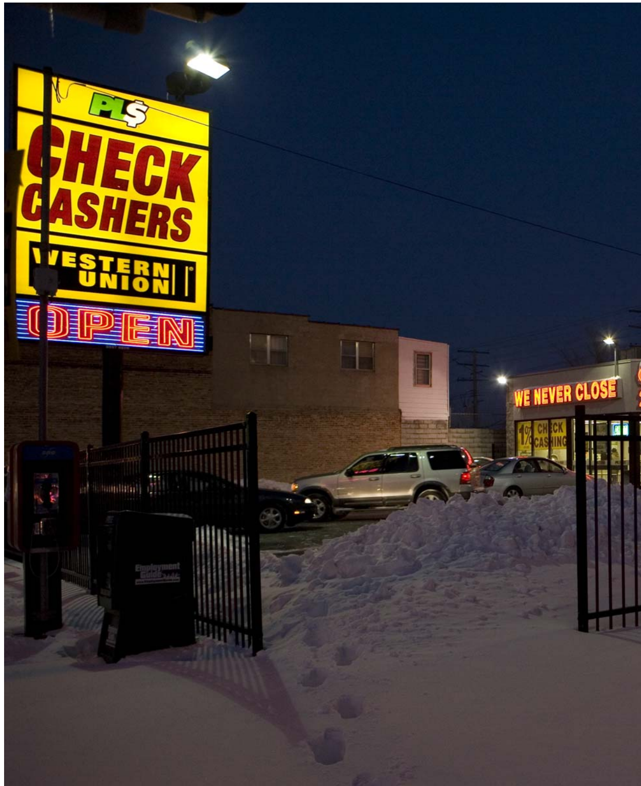
At right: Check Cashers on Broadway (Gary, IN), 2007.