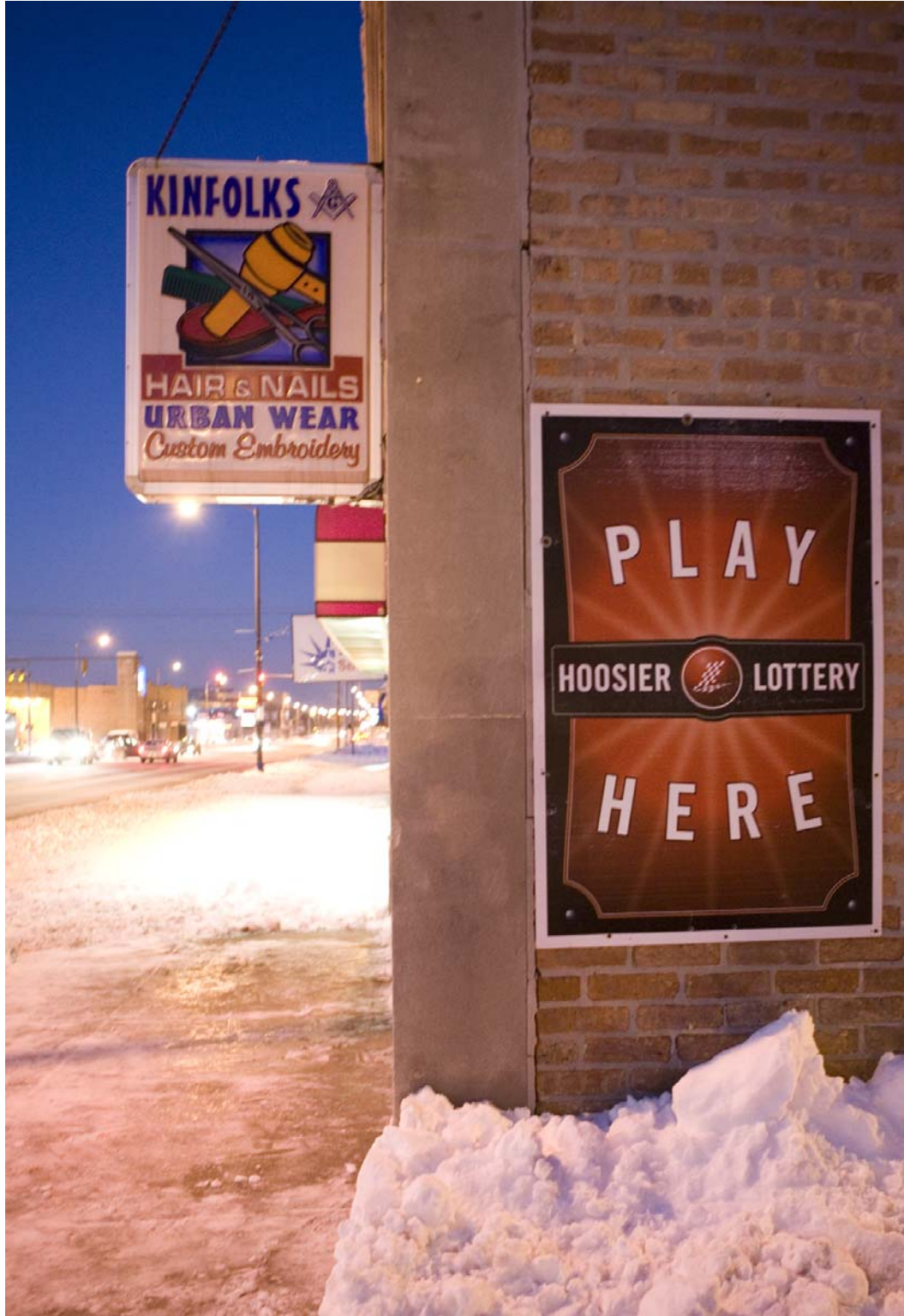
At left: Hoosier Lottery Sign on Broadway (Gary, IN), 2007.