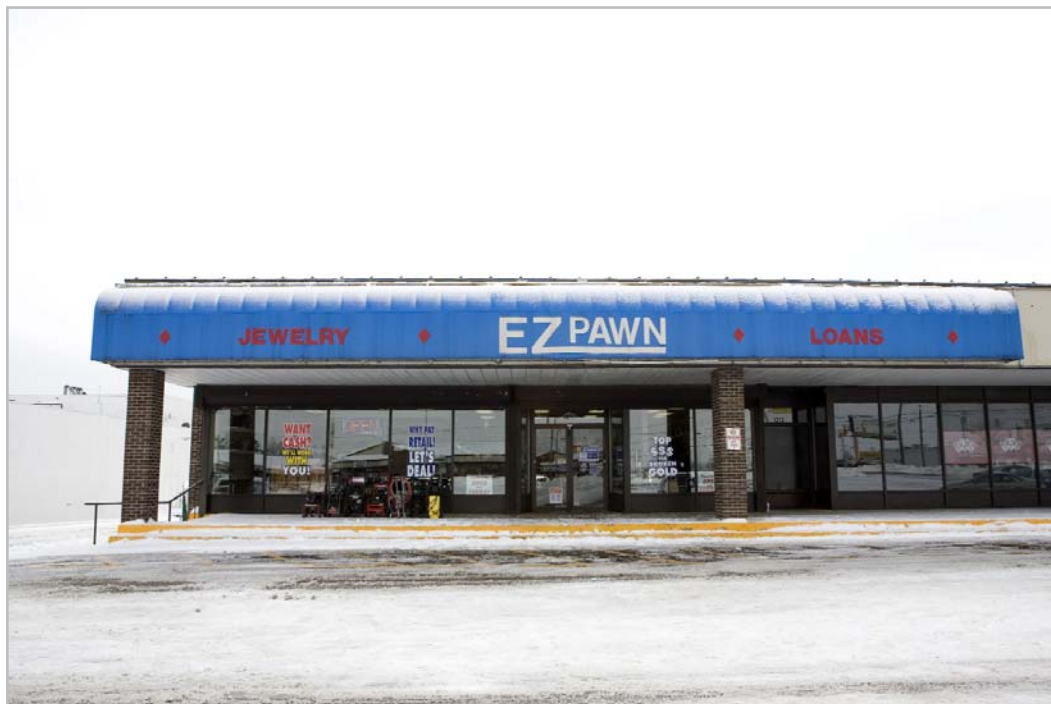
At left: EZ Pawn Shop on McGalliard Road (Muncie, IN), 2007.

One strategy was to make the small loan business more profitable for banks and other legal lending institutions. The reformers essentially agreed with the bankers: Restrictive usury laws kept commercial lenders out of the consumer credit business and fed the growth of the illegal loan sharking businesses. By increasing the interest rates allowed under the law, however, the reformers hoped to create an incentive for banks to get into the consumer lending business. Once legal lenders got into the business of making personal loans, they believed, loan sharks would be driven out.