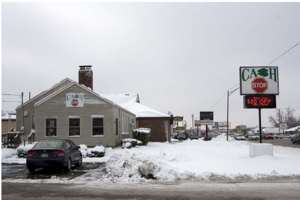
At left: Cash Stop on McGalliard Road (Muncie, IN), 2007.

But the most striking transformation has occurred in the financial services on McGalliard Road. Fifteen years ago, branches of local banks and a few personal loan companies made up the financial institutions on the road. Today, the bank branches remain, but they have been engulfed by a tide of payday lenders. Along