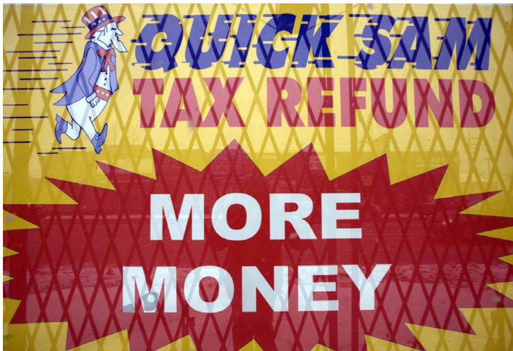
At left: Sign from Quick Sam Tax Refund on Broadway (Gary, IN), 2007.

Filene turned to the model of cooperative credit associations, small groups of members with preexisting ties to each other who pooled savings and provided one another with low-cost credit. Rooted in the principles of economic democracy and mutual aid, the cooperative credit movement originated in Germany in the nineteenth century and later spread through Europe and into the corners of the British Empire. During a trip to India in 1907, Filene encountered these “people’s banks” and came away impressed by the savings and microlending opportunities that they offered to the poorest villagers. Similarly impressed by the models of “ caisses populaires ” in Canada, Filene saw the credit union as the institutional means for realizing