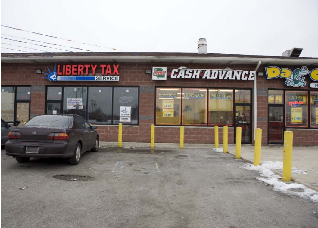
At left: (top) Access Cash Advance on Broadway (Gary, IN); (bottom) Allied Cash Advance on McGalliard Road (Muncie, IN), 2007.