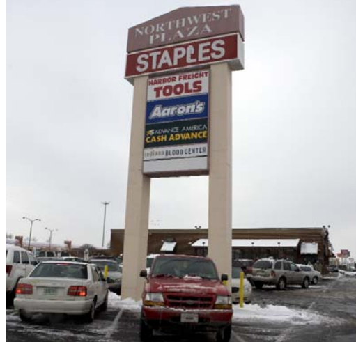
At left: Signs from various strip malls located on McGalliard Road (Muncie, IN)