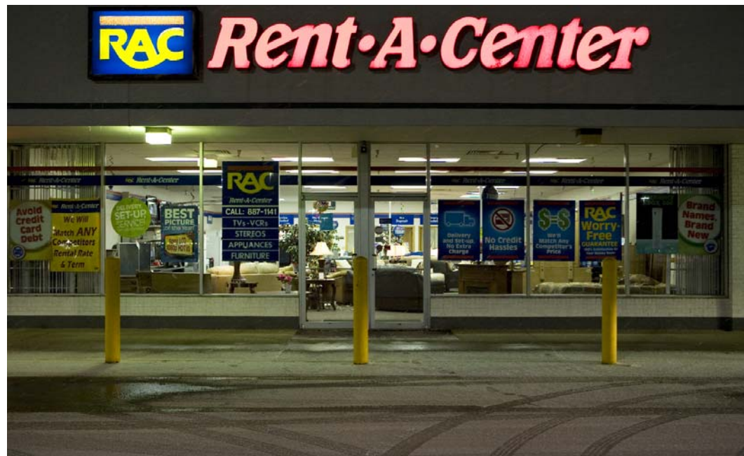
At right: Rent-A-Center Store on Broadway (Merrillville, IN), 2007.

Today's anti-thrifts are not new. Some have been around for decades, and others, like the pawnshop, for centuries. But until recently, they existed as small operations located on the fringes of the financial world. Since the 1990s, they have aggressively moved into new markets and become national franchise operations, some with ties to the corporate banking industry.