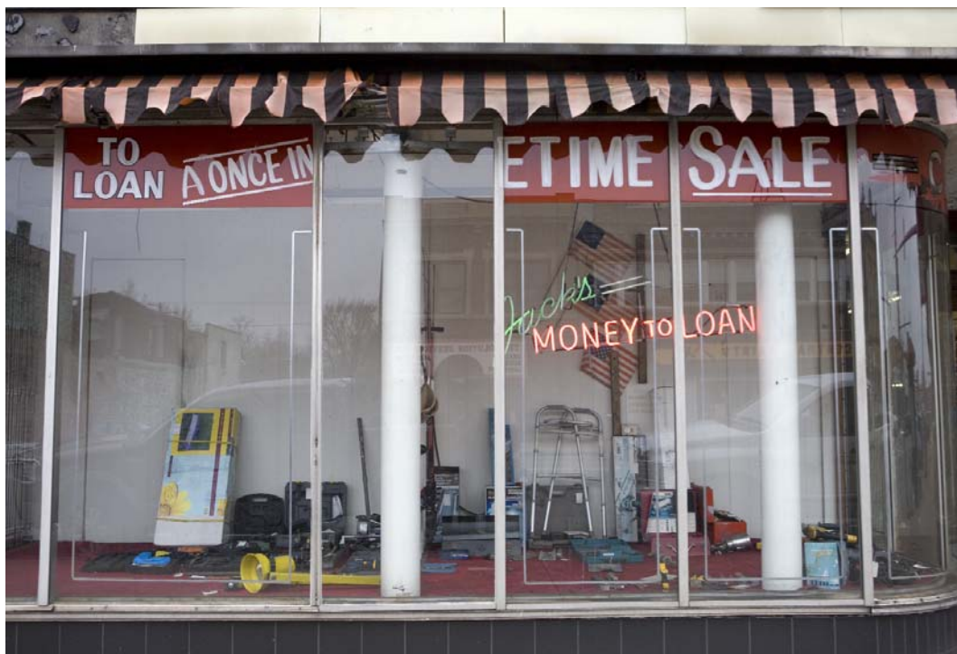
At left: Jack's Pawn Shop on Broadway (Gary, IN), 2007.

I N MID-TWENTIETH CENTURY AMERICA, a strapped wage earner who needed extra cash to pay an overdue utility bill, repair the family car, or make the rent had limited ways to get the necessary funds. Family and friends were often the first source of a short-term, possibly interest-free, loan. Failing that, pawn shops would take a wedding ring, musical instrument, fur coat, or some other piece of personal property as security for a small, high-interest loan. As a last resort, the local loan shark could provide the cash at predatory interest rates.