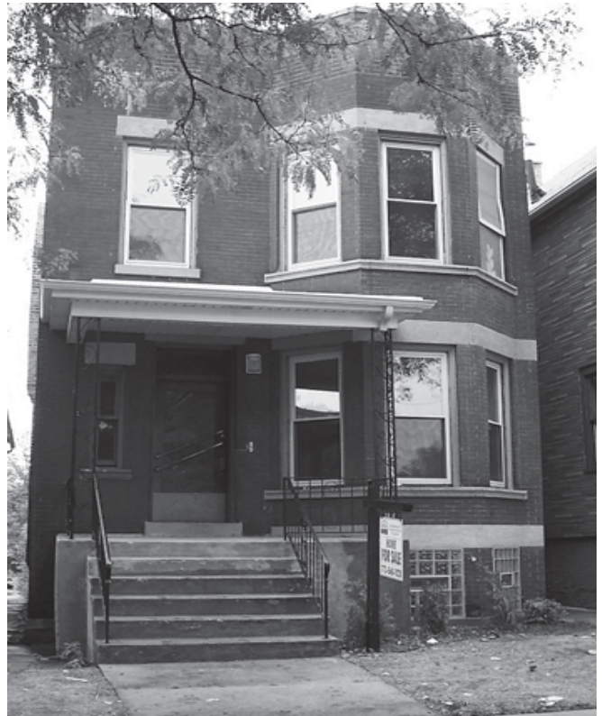
Before and after photos of 7013 S. Eggleston in the Auburn Gresham/Englewood neighborhood in Chicago. Before entering the TBI2 program the vacant property had multiple code violations and was used by area gangs. NHS acquired the home, rehabbed it, and sold it to a first time homebuyer.