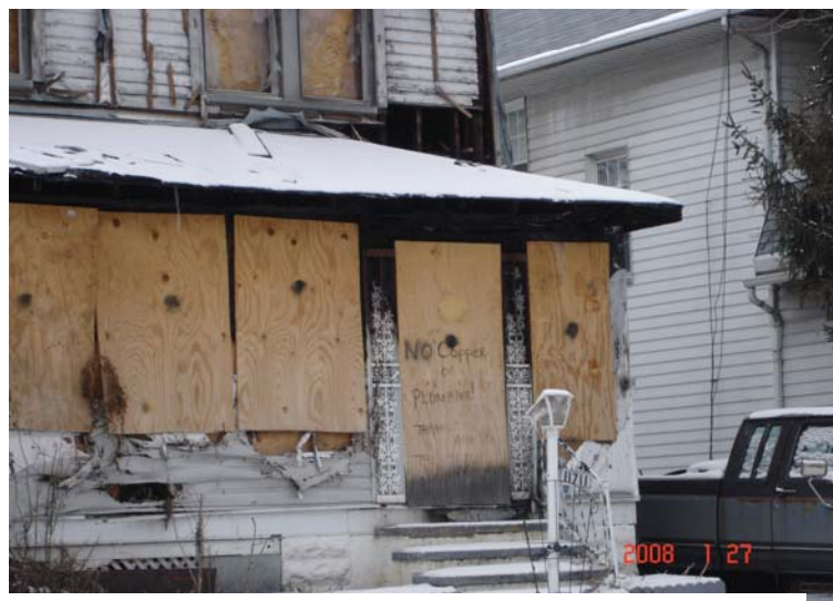
A vacant, boarded Cleveland house with aluminum siding stripped. The handwritten message to would-be vandals, scrawled on the plywood, reads "No Copper or Plumbing! Thanks a lot."