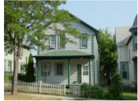
A unit renovated by Dayton's Bluff.

Dayton's Bluff is a seasoned CDC with extensive experience in both single family and multi-family housing. But the scale of the foreclosure crisis threatens to overwhelm its efforts. On its own, Dayton's Bluff could not wield the political clout needed to bring servicers, politicians, and other policymakers to the table with the speed required in order to marshal a timely response. Nor would it be able to raise the huge amounts of capital required to acquire and renovate properties. At the same time, the consortia and collaborative that have grown up in the Twin Cities area could not be effective without groups like Dayton's Bluff. Both are part of the essential infrastructure that will be needed to turn thousands of vacant, foreclosed properties from neighborhood eyesores to neighborhood assets.