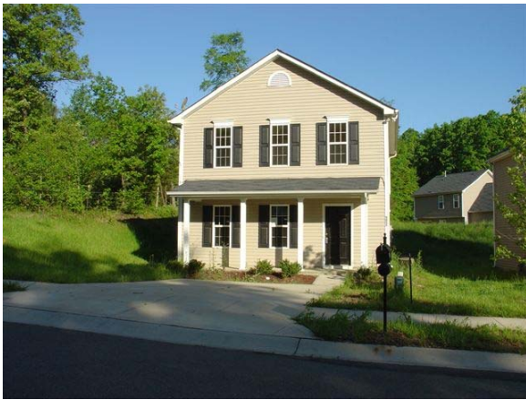
A unit in the Peachtree Hills subdivision.