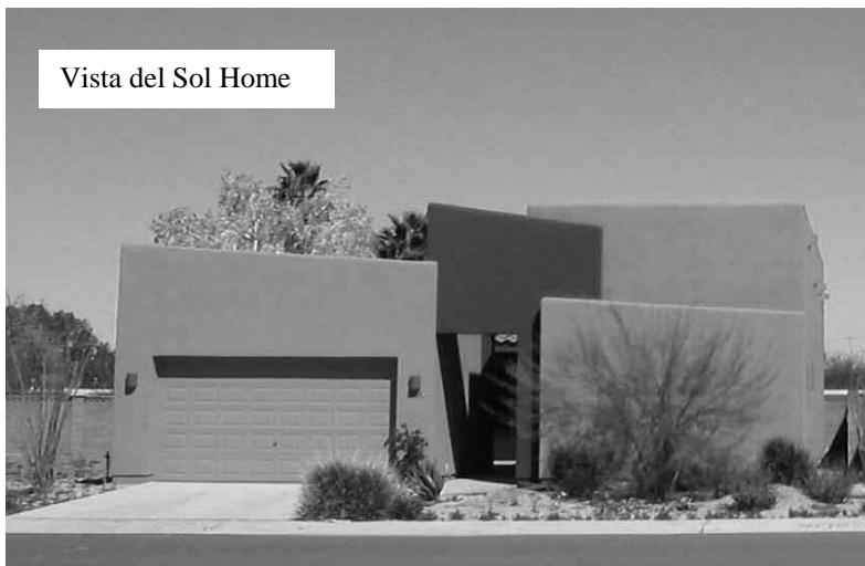
Vista del Sol Home